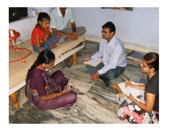
Figure 2. Testing the DTMF interface with a participant at her home.

a landline phone in both treatments. The remaining 7 participants, all women, were tested in their homes due to their traveling constraints. In the field, we attempted to be faithful to the office environment by testing in a quiet room with only the researchers and one family member of the participant present. A landline phone was not available, so we used a mobile phone. Participants in the DTMF treatment were provided a headset so that the dialpad could remain in front of them (see figure 2).