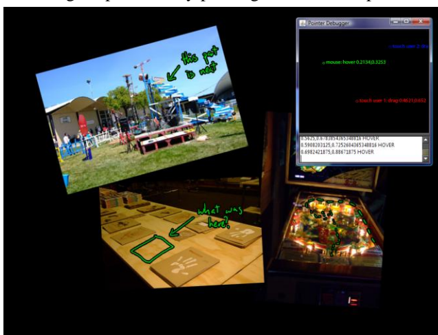
Figure 2: Photo tagging application we developed using the Pointer API. Users can move pictures with their hands and annotate them with a pen. Inset: the debug sidebar.