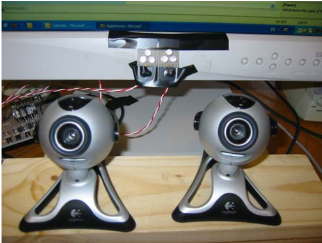
Figure 1: The low-cost prototype in development uses commercial-over-the-shelf cameras modified to work in the infrared spectrum. The glint source pictured above uses IR LEDs (invisible to the human eye).