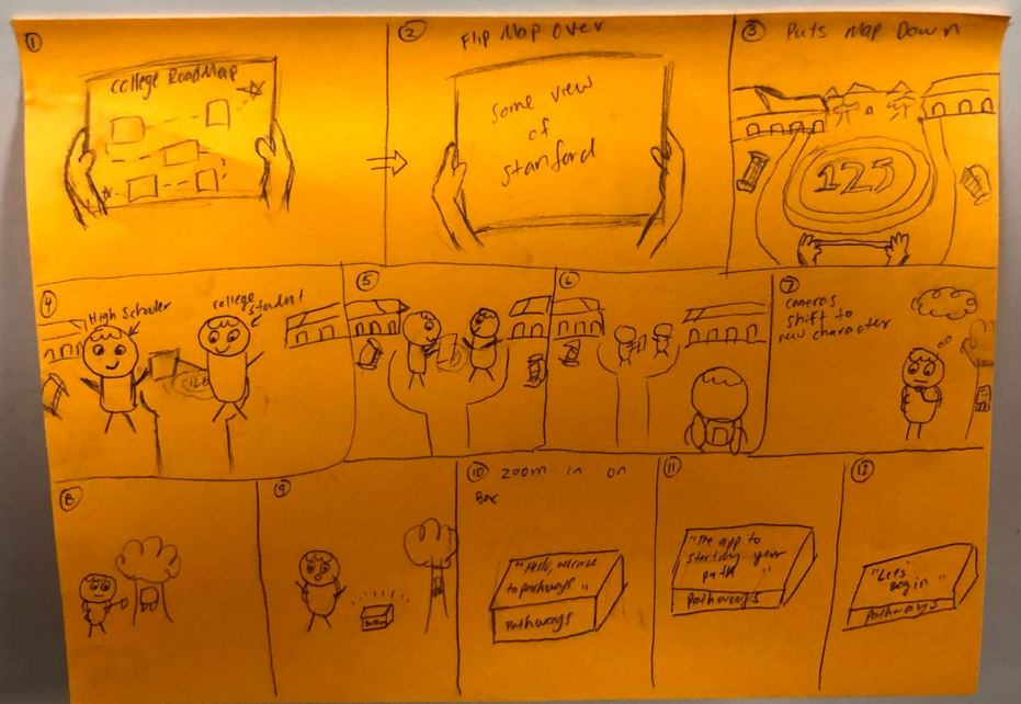
*Photos of individual post-its are in Assignment 3's Storyboarding folder*