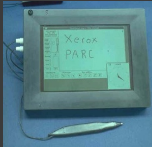
PARCPAD / mPAD (foot)