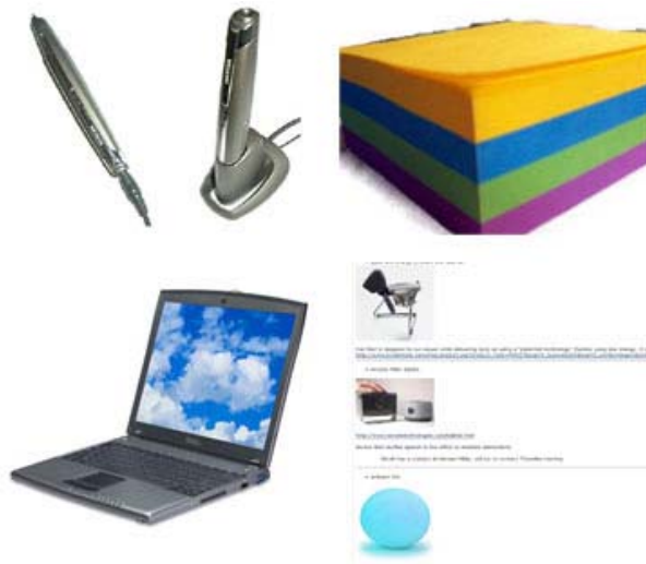
Figure 1. Elements of Paper Collaborator prototype.