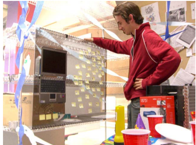
Figure 2. Initial Anoto Pen based interface installed in the ME 310 Daikan Teams workspace.

Our first prototype consisted of an acrylic board mounted to a storage rack in the workspace of the ME310 project team who agreed to test out our prototype. Attached to the board was a laptop that served as a screen and the Anoto pen. To the right of the laptop was a large, open area where we arranged the icons representing documents. Each icon consisted of a thumbnail and a patch of Anoto paper glued to a small Post-It. They were arranged from top-to-bottom, left-to-right in reverse chronological order of when the document was made available to the project team. The use of Post-Its was chosen because they allowed for rapid updating of the display and enabled the user to rearrange the display as they saw fit.