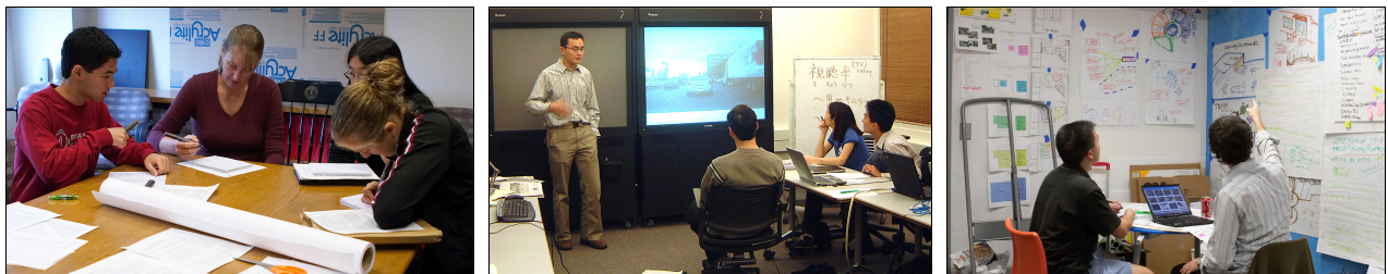
Figure 2. Design in situ . Designers and students work with a variety of physical and digital media during group activities.

These studies of design education have produced several insights. In the following sections, we identify three facets of design practice that demonstrate the potential of a social approach to cognitive design artifacts.