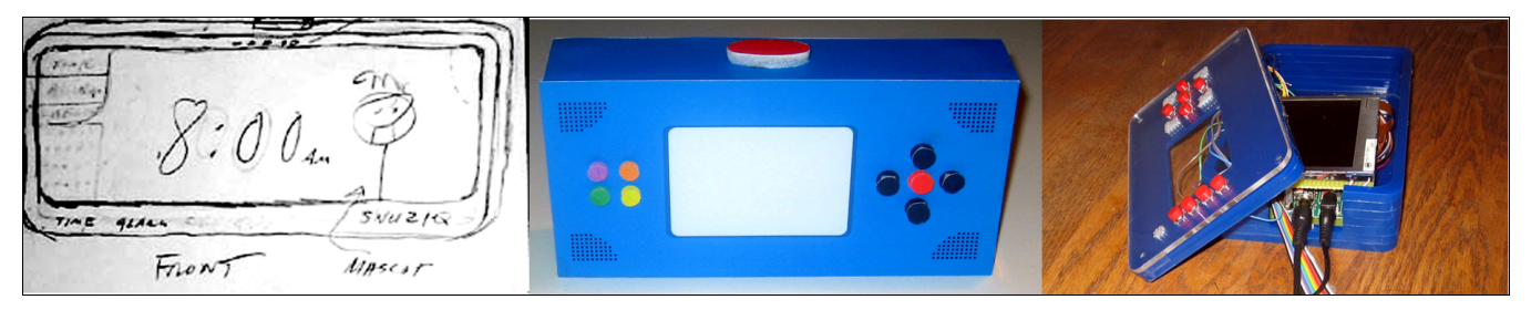
Figure 3 A paper sketch, physical mock-up, and final prototype, showing how the interface of SnuzieQ, an alarm clock, evolved through prototyping.

When compared to other human operated machinery (such as the automobile), today's computer systems make