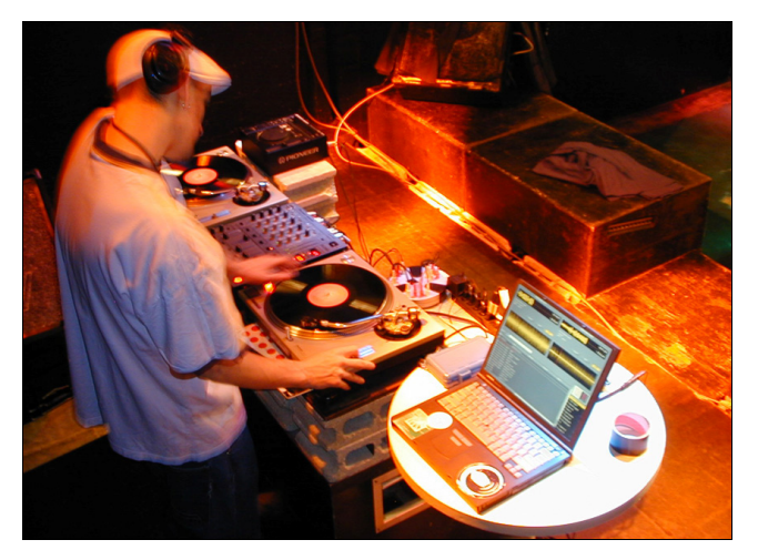
Figure 8 Final Scratch: encoded vinyl for digital music.

sensory richness or the nuance of manipulation offered by the "real thing."