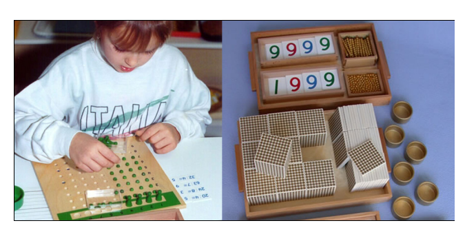
Figure 1 With Montessori blocks, concepts such as distinct numbers are represented through distinct physical sizes, shapes, and colors.

Just as moving about in the world helps infants to learn about the physics of the world and consequences of actions,