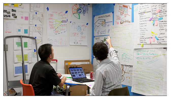
Figure 7 Butcher paper lines the wall of the Stanford d.school meeting room.

The visibility provided through collocated practice with task-specific artifacts is also successful in supporting synchronous collaboration, and can be especially useful in mission-critical systems. Mackay's air traffic control studies [41] focused on the role of the paper flight strips that provide a hand-scale physical representation of airplanes. Her primary finding was that controllers coordinate the management of air traffic by coordinating the management of flight strips. As we are much less likely to ignore a colleague who presents a request by walking into our office than by sending an email (partially because "receipt" of the request is much more visible), Mackay found the physical act of handing a strip to have important properties not easily replicated in electronic systems. The social life of physical artifacts and their visibility facilitate distributing the cognitive work of groups (e.g., [26, 29]).