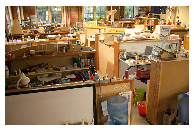
Figure 6 The Stanford Product Design loft studios.

over prolonged use. Physical feedback can further help to distinguish commands kinesthetically.